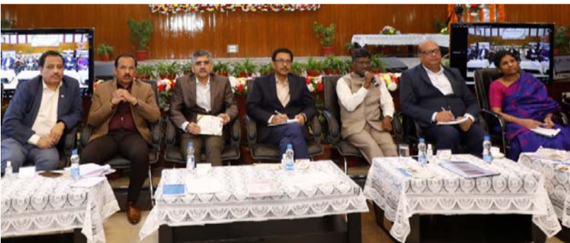
VIS News Service

Highlights Pan India door-door pickup & delivery