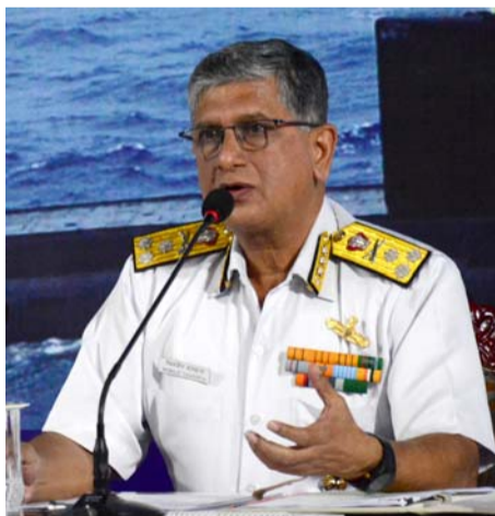
Regular interaction with MSMEs crucial for building capabilities for Navy.

'The talks on FSS are in advanced phase of discussions wherein the project is expected to be received by HSL' said the CinC'.