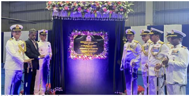
VIS News Service

To help enhance security in waters of TN & Andhra